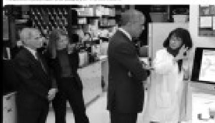
President's Visit to NIH Highlights Research on Ebola President Obama and Vice President Biden with Dr. Francis Collins

December 2, 2014 Barack Obama Speech, NIH